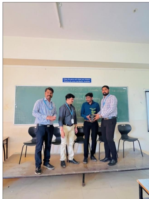
Glimsese of Guest Lecture.